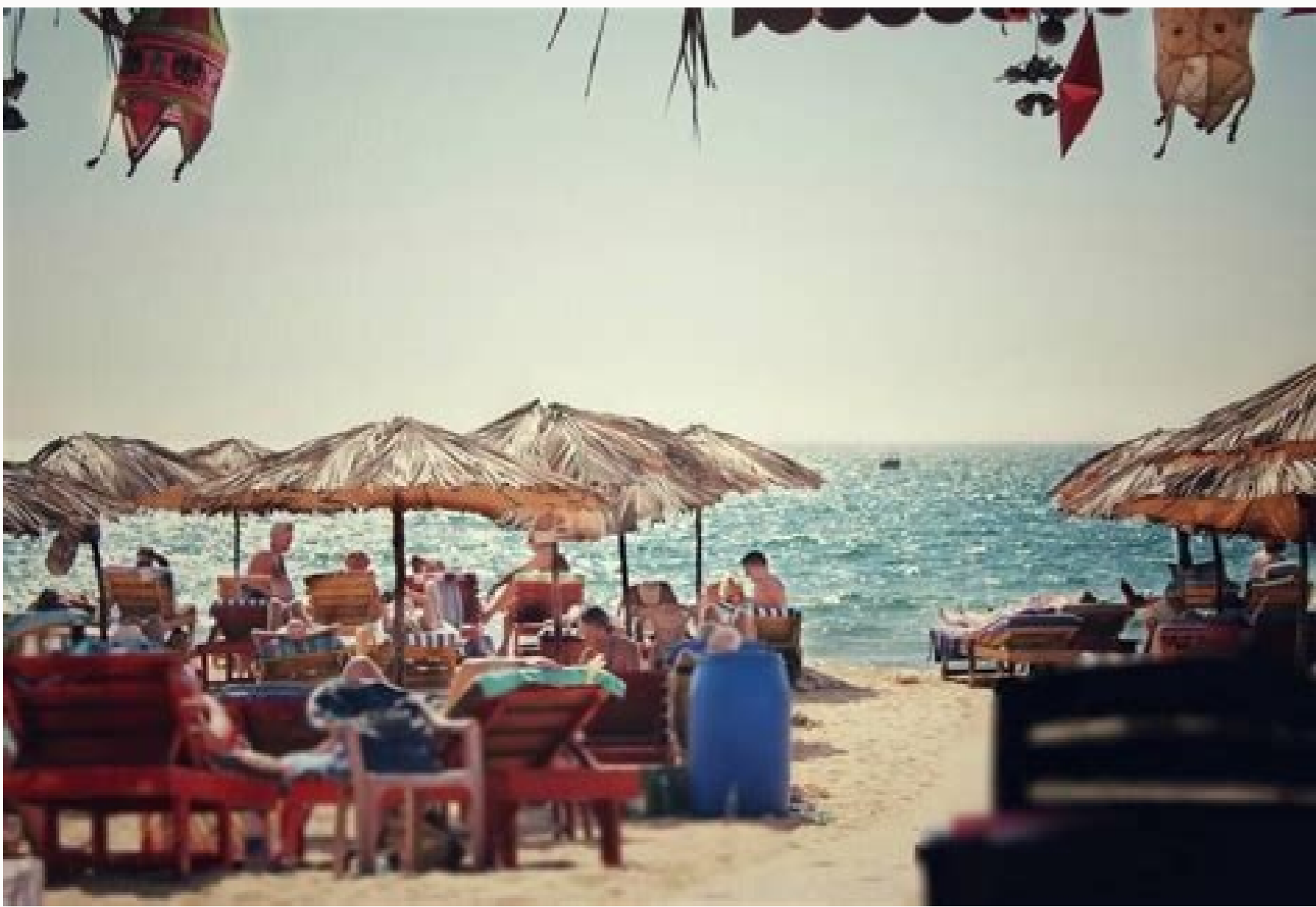
Candolim goa places to visit. Candolim goa things to do.